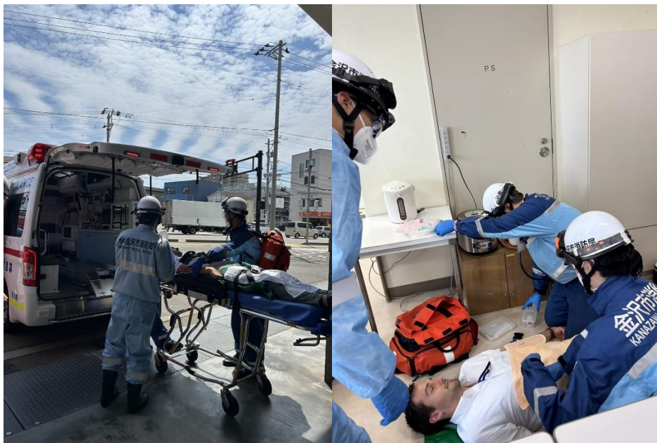
＜Me receiving first aid and getting carried in the back of an ambulance during a first aid training session.