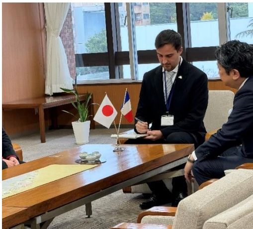
＜Me interpreting for the mayor during a French delegation visit.